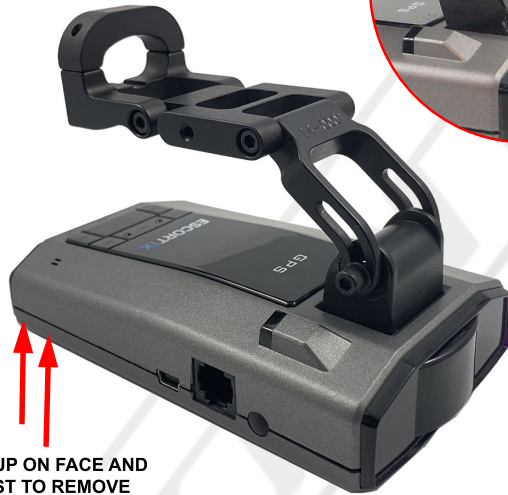
PUSH UP ON FACE AND TWIST TO REMOVE

6 The center-link may be removed if an overall shorter mount length is needed, depending on your rear view mirror and desired position for the RD. With multiple adjustments available, you should be able to position your RD right where you want it. If you are unable to achieve this, be sure to contact us at 1-707-664-8234