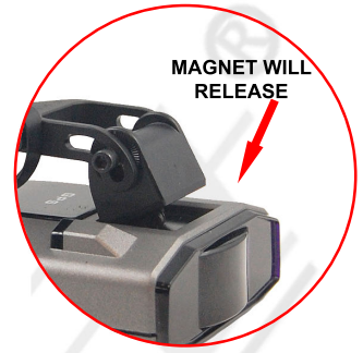
MAGNET WILL RELEASE

7 To remove the radar from the magnetic mount, simply tilt the face of the RD up and twist slightly to side, then the magnet will release.