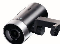
M2 Smart Dash Cam

DO NOT use this kit if it interferes with the adjustability or the operation of your rear view mirror in any way.