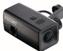
M1 Dash Cam

Radar Detector & Dash Cam not included**