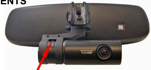
SPRING CLIP HORIZONTAL ADJUSTMENT SCREW

3 - Using the upper and lower pivot screws, adjust the mount to achieve your desired location of the dashcam. We recommend adjusting it as high as you can. You can also use the spring clip horizontal adjustment screw to help center the dashcam with the mirror as shown above.